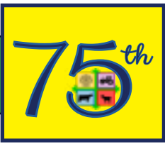
Exhibit Info & Rules