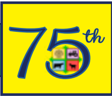
Exhibit Entry Form