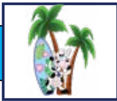
EXHIBIT INFO AND RULES